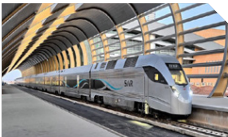
Saudi Transport and Logistics Services Exhibition