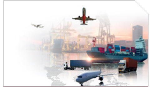
Exhibition and Conference on Investment Opportunities in Commercial Transport and Transportation

Riyadh Front Exhibition & Conference Center