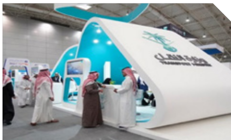
Logistics Services Exhibition

Riyadh International Convention & Exhibition Center