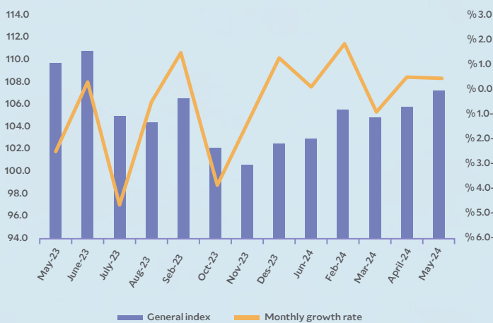
Figure 1. General industrial production index and monthly growth rates