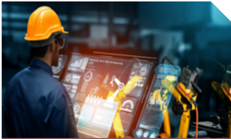
Arab and Gulf Industries Exhibition