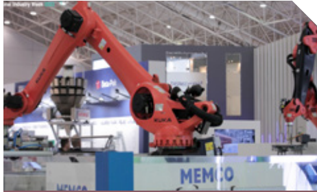
Logistics Services Exhibition