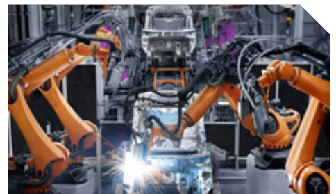
Saudi Smart Manufacturing Exhibition

Riyadh International Convention & Exhibition Center